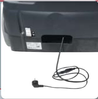
The plug-in onboard battery charger ensures continuous and hassle-free operation.