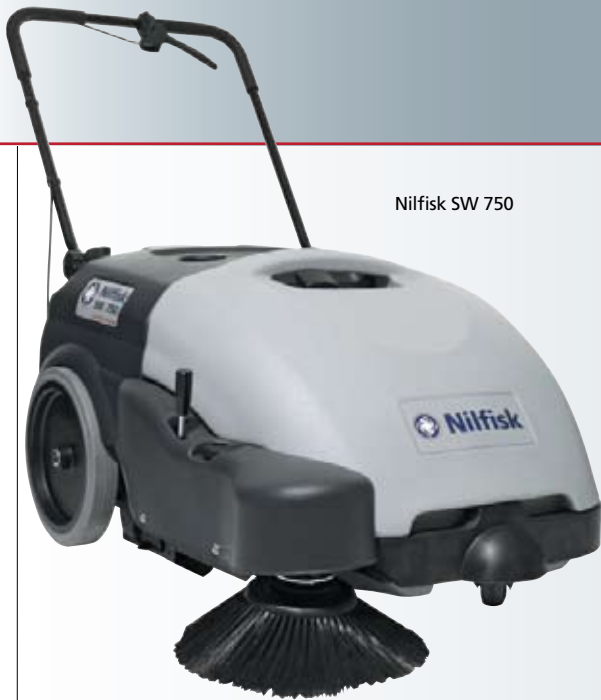
Nilfisk SW 750

Moreover, it cleans so silently that it can be used even in the most noise sensitive areas. At just 59dba, the SW 750 is suitable for daytime cleaning without risk of causing disturbance. In fact, the entire design is so efficient, and so cleverly thought-out, that productivity is assured even with an inexperienced operator, while operating costs are minimized.