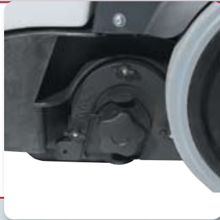
The main and side brushes are adjustable to ensure perfect pressure on the floor at all times and in all conditions.