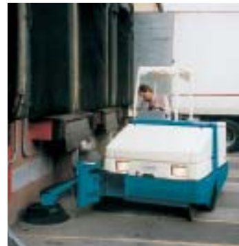
The Model 6550's optional SB2 auxiliary sidebrush cleans areas not accessible to regular sweepers.