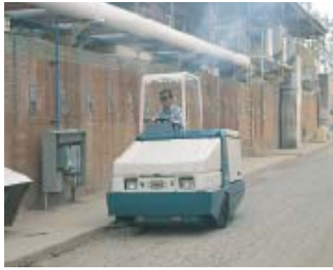
Picks up even the rocky debris found in brick-yards and cement plants.