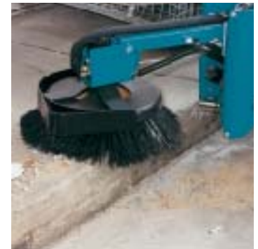
While the main brush sweeps debris on street level, the SB2 cleans up on the curb.