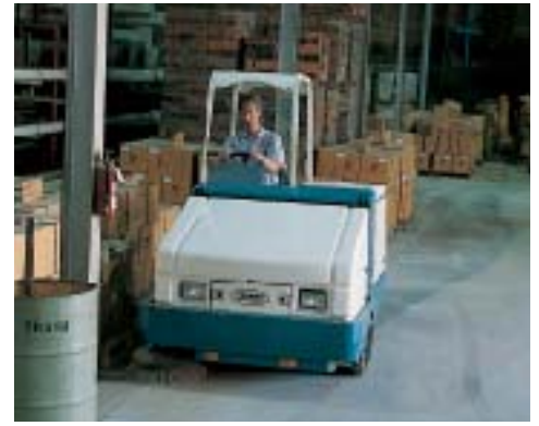
Il-Speed™ sweeping controls the dirt, litter and dust of almost any surface, no matter how rough the environment.