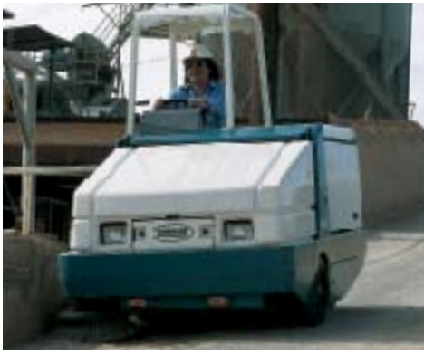
A stress-tested, steel-plate frame encases the 6550 to protect both internal components and the operator.